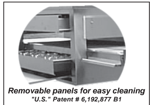
Removable panels for easy cleaning "U.S." Patent # 6,192,877 B1

Ideal for a variety of cooking applications including pizza, seafood, omelettes and other egg dishes, pre-cooked meats, cookies, bakery products, pita breads, heating plated Mexican food and hot submarine sandwiches.