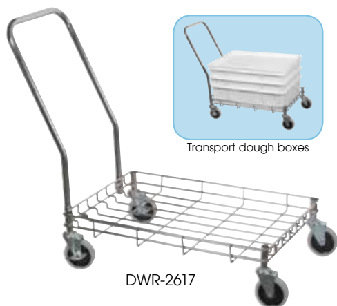
Transport dough boxes