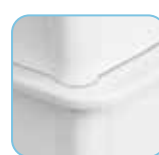
Seamless fit for extra fresh storage needs