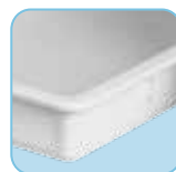
Reinforced edges & corners