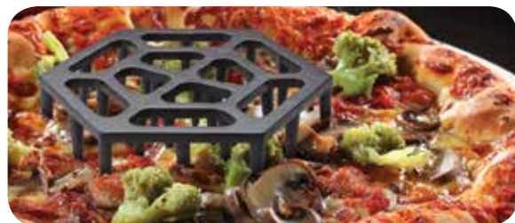
Distribute heat through thick centers