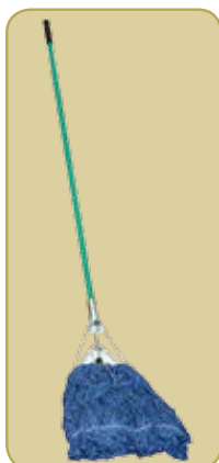
Blue mop head shown on metal broom handle