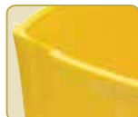
Convenient slot on bucket fits 2" wide putty knife