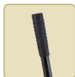
Powder-coated handle with rubber grip