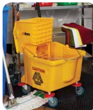
Bucket, side-press wringer and casters also available separately