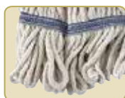
Loop-end strands do not fray or unravel