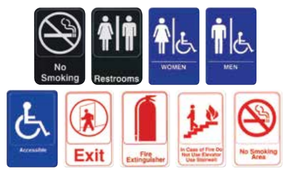
SGN-SERIES 6" X 9"