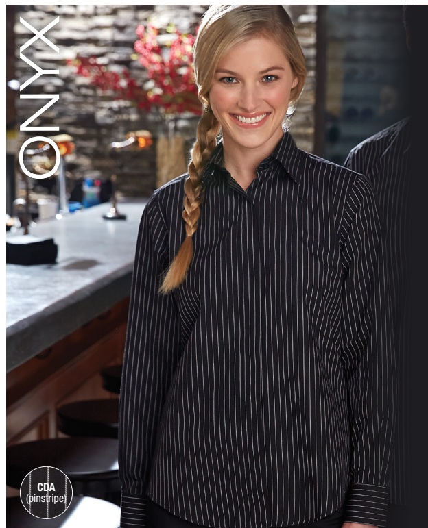
3.3 oz. 65/35 poly/cotton, built-in collar stays, adjustable cuffs, double back yoke, covered placket Available in CDA