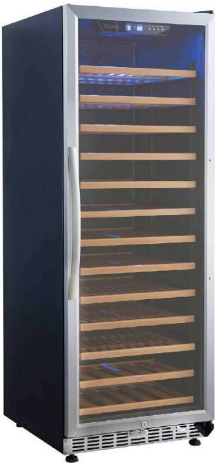
USF128S - Single Temperature